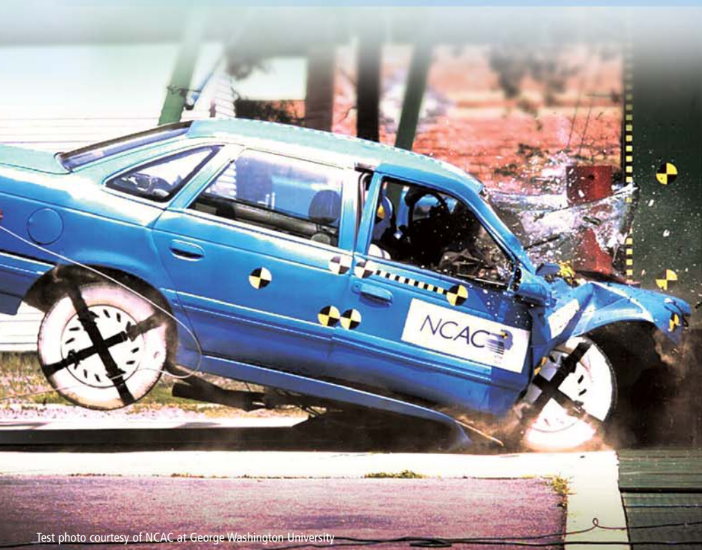
Test photo